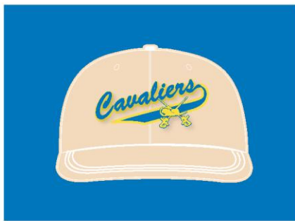
Logos located on back of hat Logos may vary from pictures

100% Cotton Cavalier Hat & Optional Sport or Anniversary Logos